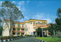
MANGATTUPARAMBA CAMPUS Mangattuparamba Campus P.O. Kannur-670 567