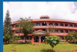
MANANTHAVADY CAMPUS Edavaka P.O, Wayanad, 670 645