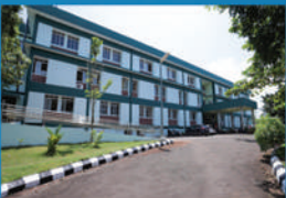
SWAMI ANANDATHEERTHA CAMPUS PAYANNUR Edat P.O, Kannur- 670 327