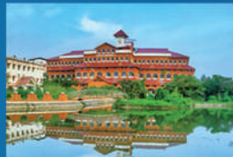
THAVAKKARA CAMPUS Thavakkara, Civil station P.O Kannur 670 002