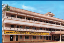
KASARAGOD CAMPUS Vidyanagar P.O, Kasaragod- 671 121