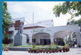
Dr. JANAKIAMMAL CAMPUS PALAYAD Palayad P.O, Kannur- 670 661