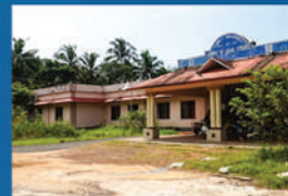
MANJESWARAM CAMPUS Manjeswaram, Kasaragod, 671 323